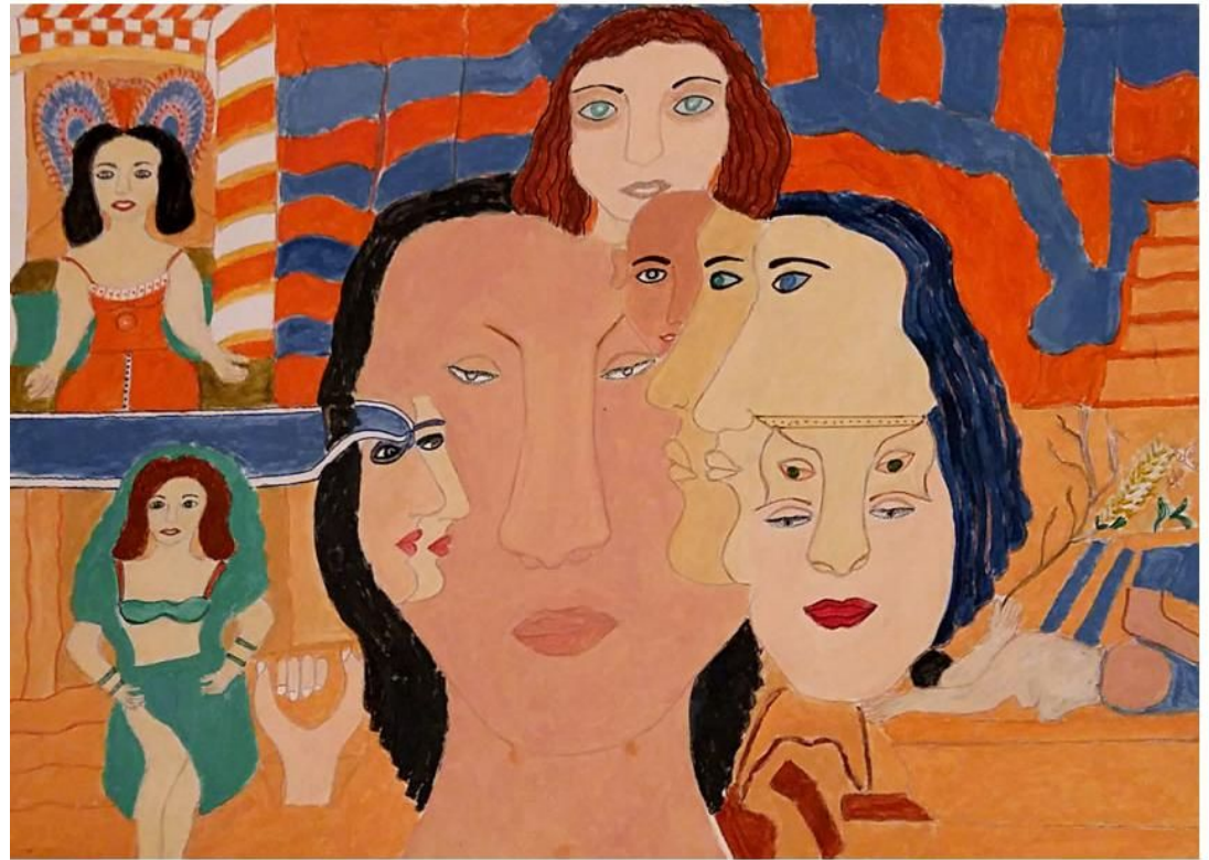
Reza Shafahi (Tehran, Iran) Vision, see nothing I don't see. Language, say nothing, 2018 Acrylic on paper 50 x 70 cm. 20 x 28 in.