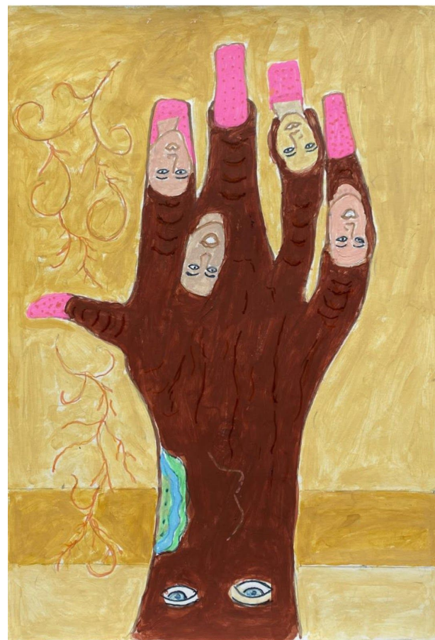
Reza Shafahi (Tehran, Iran) I have five things to say No.2, 2018 Acrylic on paper 50 x 70 cm. 20 x 28 in.

For more information on the gallery's presentation, please contact info@artlexing.com